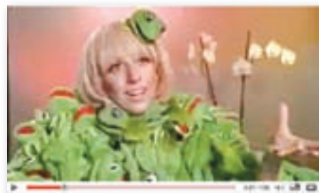
FROG FASHION: Lady GaGa in her Kermit coat

Lady GaGa: Kermit the Frog (and The Muppet Show ) is a wonderful childhood memory I share. I had no idea that jacket would make such a splash*. I thought it was comical because I don't wear fur, so there was something morbid* and hilarious* about wearing a jacket made of lots of 'dead' Kermits!